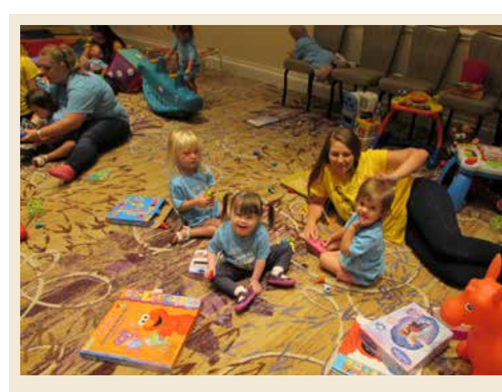
247 of our youngest attendees had a super great time in our Kids' Camps – this year with even more activities for every age group!

Ninety exhibitors showed off their stuff, including 20 self-advocate exhibitors!